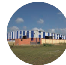
⑭ Alpha Security Instruments (India) Private Limited