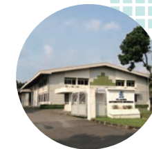
⑮ PT.ALPHA AUTOMOTIVE INDONESIA