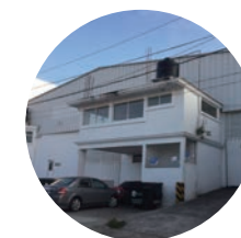
⑳ ALPHA INDUSTRY PUEBLA, S.A. DE C.V.