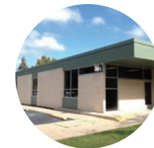
⑰ ALPHA TECHNOLOGY CORPORATION