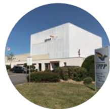
③ Société de Peinture de Pièces Plastiques SAS