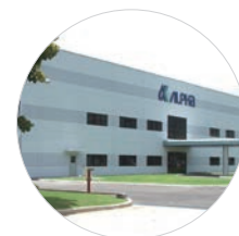
⑪ ALPHA INDUSTRY (THAILAND) CO.,LTD.