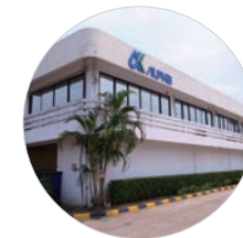
⑫ ALPHA HOUSING HARDWARE (THAILAND) CO.,LTD.