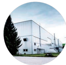
④ SPPP Slovakia s.r.o.