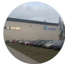
① Alpha Vehicle Security Solutions Czech s.r.o.