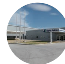
⑲ Alpha Industry Jalisco, S.A. DE C.V.