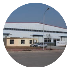
⑦ ALPHA (XIANGYANG) AUTOMOTIVE PARTS CO., LTD.