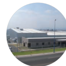
⑱ ALPHA INDUSTRY QUERETARO, S.A. DE C.V.