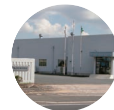
㉑ Kyushu Alpha Co., Ltd.