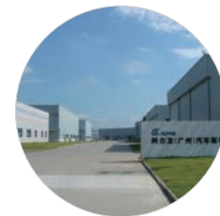
⑥ ALPHA (GUANGZHOU) AUTOMOTIVE PARTS CO.,LTD.