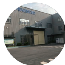
⑨ ALPHA ADVANCED AUTOMOTIVE PARTS CO.,LTD.