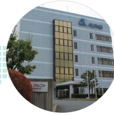
⑰ ALPHA Corporation